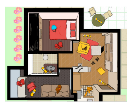
Figure 5 – Messy house game setting

In the third and final game, the user moves through the setting of a house with six rooms and must find the hidden rehabilitation equipment (Figure 5). This game reinforces the learning about the use and care with ortheses which are part of daily routine.