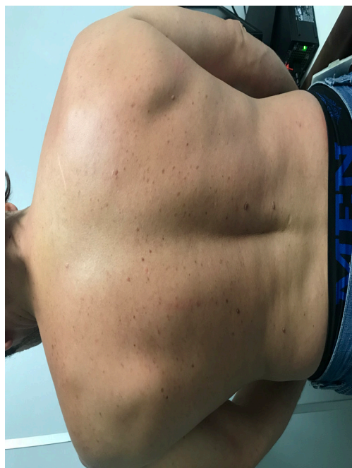
Figure 5: Good response to combined NB-UVB phototherapy

NB-UVB phototherapy (narrow band ultraviolet B - range between 311-312nm) was used as combined therapy and showed satisfactory results after the sixth session, as the erythematous edematous papules and pruritus disappeared (Figure 5). Prolumina cabin – 21 NB-UVB lamps was used. Initial dose of 50mj/cm 2 (33”), with an increase of 50mj per session, according to adverse effects, on Tuesdays and Fridays. Maximum dose reached was 1050mj (11’40”). Remission of systemic symptoms was achieved as the skin lesions improved. Patient was discharged after 55 sessions, with an accumulated dose of 33 J/cm. Dexchlorpheniramine and fexofenadine were maintained during the sessions and after discharge. After one month, the condition recurred, and the patient had to restart the treatment.