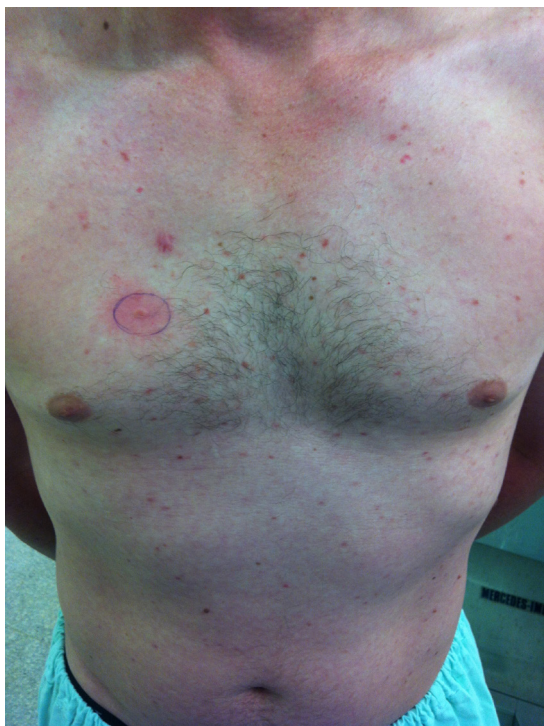
Figure 1: Erythematous papules with positive Darier's sign.

We present a rare case of mastocytosis in an adult, with symptoms and lesions limited to the skin. The absence of a systemic involvement was confirmed by thorough clinical and laboratory investigation.