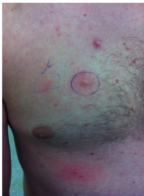
Figure 2: Detail of the Darier's sign.

Examination showed small erythematous, edematous papules that disappeared on finger pressure on the anterior surface of the forearms and on the trunk, with a positive Darier's sign (Figures 1 and 2). Older lesions were brownish and did not blanch when pressed (Figure 3). The patient complained of itching and burning sensation. In subsequent consultations, he reported abdominal colic, dizziness, and tachycardia.