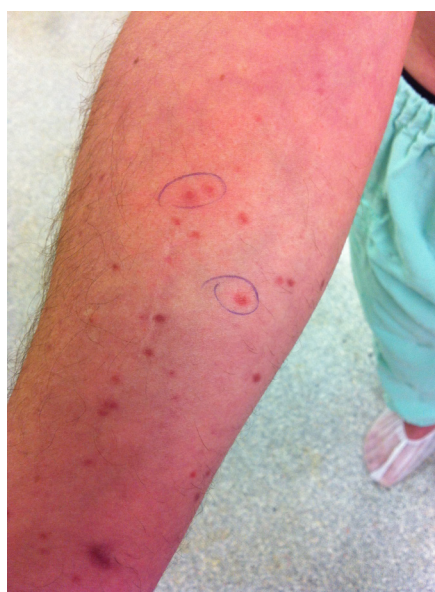
Figure 3: Older brownish papules