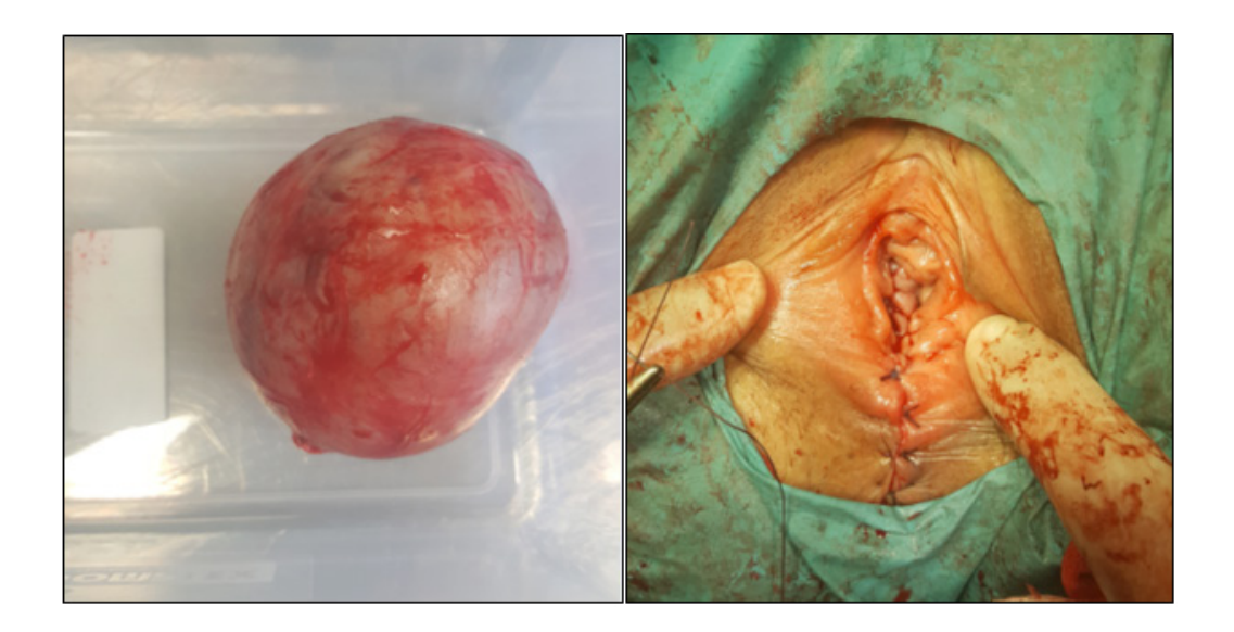
Figure 1: Gross pathological specimen of vaginal mass excision; Figure 2: Picture of perineum after surgery