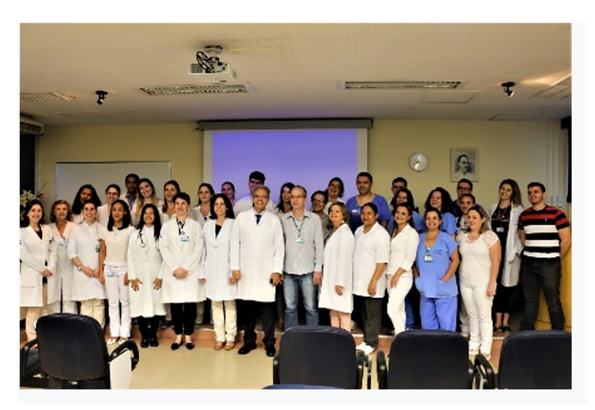
Figure 4 The Integrated Group of Liver Transplantation In 2017

A and B. Finally, the whole team in 2017, as shown in figure 4.